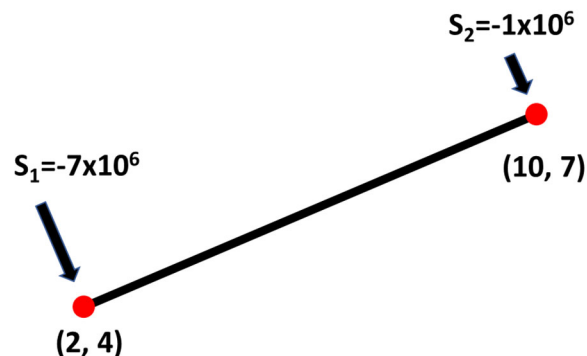
Figure 3- Apply variable stress to an inclined boundary.

The values of v_x and v_y together can be utilized to construct a gradient for the applied variable in the case of an inclined boundary. The equations can be made simpler by setting v_y = 0 and